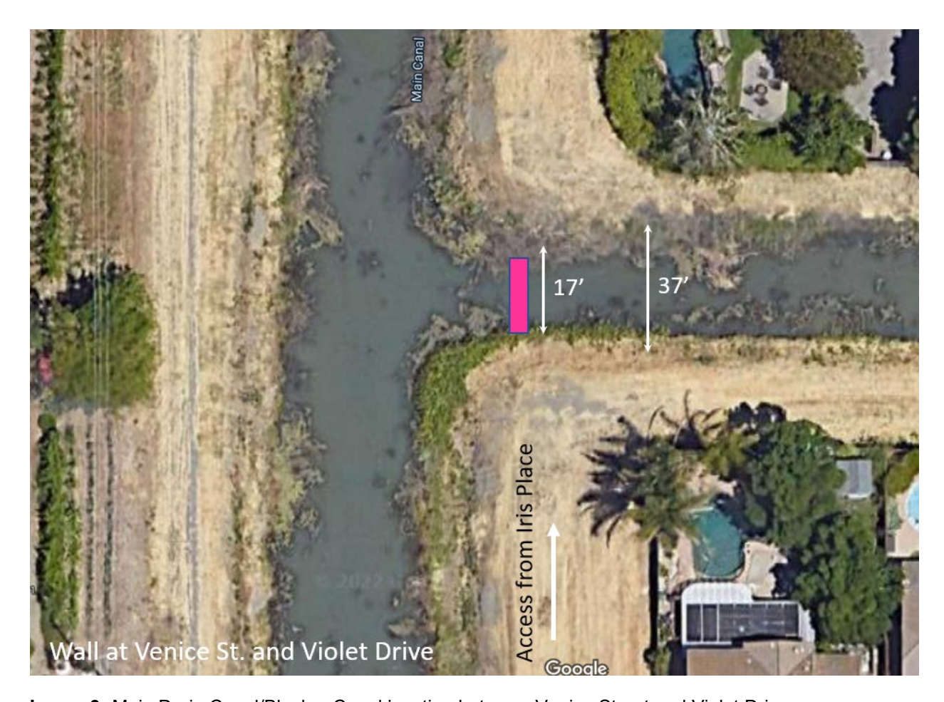
Image 3: Main Drain Canal/Blacker Canal junction between Venice Street and Violet Drive