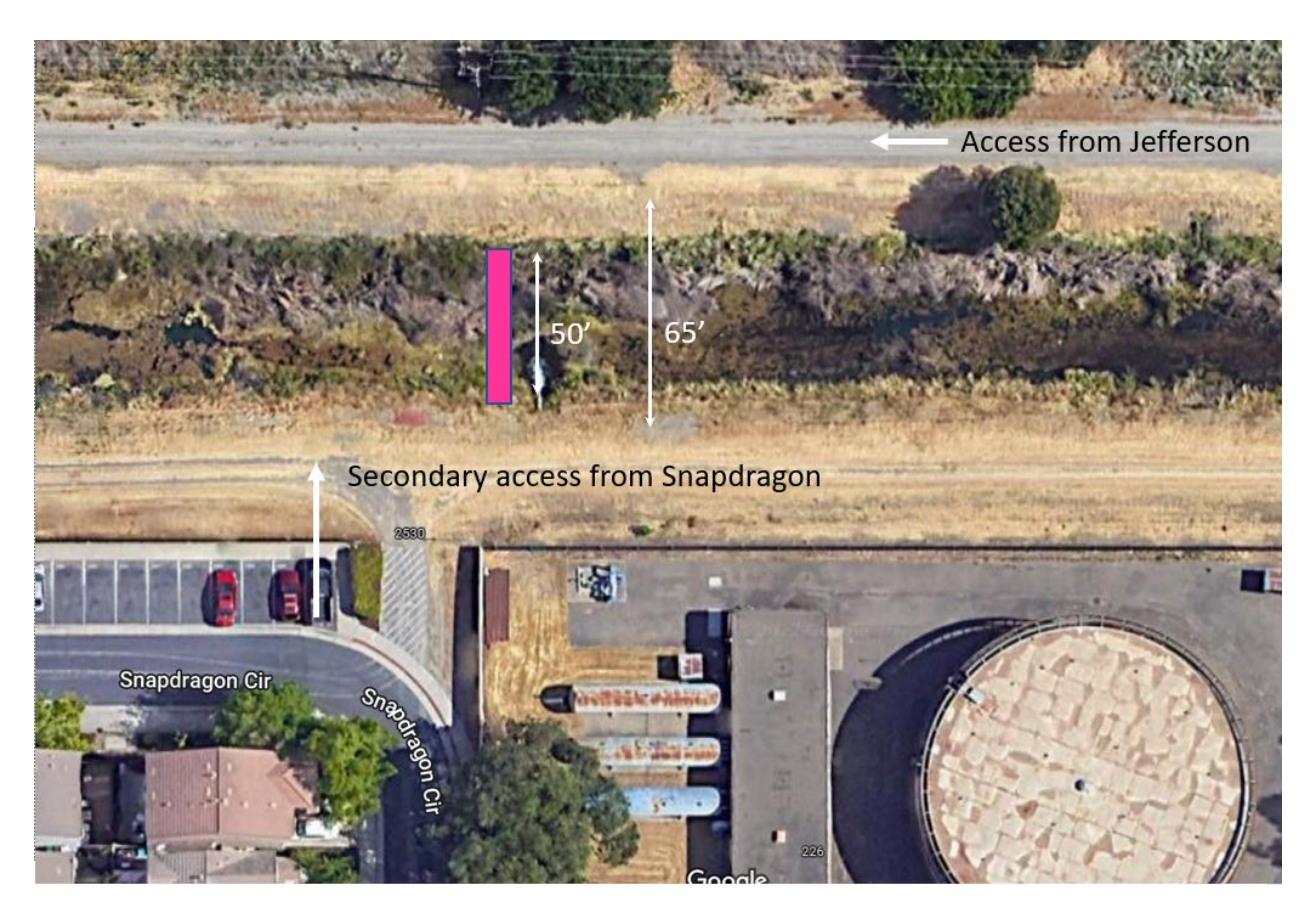
Image 2: Main Drain Canal Snap Dragon Circle and Lake Washington Blvd.at Well 20